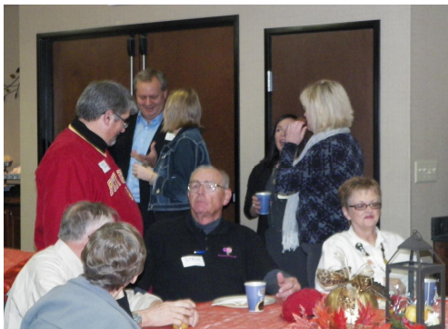
2013 Chamber Coffee