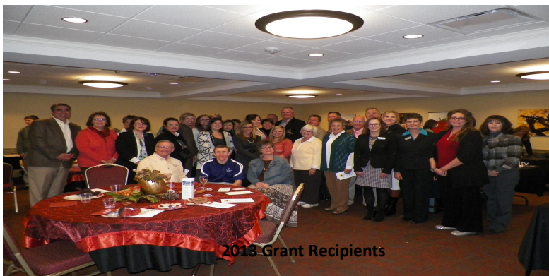
2013 Grant Recipients

Since 2004 the Foundation's grant cycles have funded 196 projects totaling $445,070.00. 48 non profit projects will be funded from grants for a total of $142, 617. The Foundation is serving the Region with funds for Basic Human Needs programs and programs directly impacting the Youth's Needs in the Region. These numbers represents granted dollars from funds the Foundation directly manages.