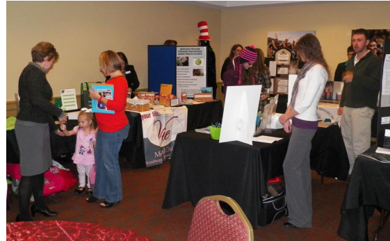
2013 Agency Fair