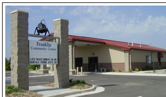
The Franklin Community Council endowment fund will provide dependable long-term funding for the Franklin Community Center.