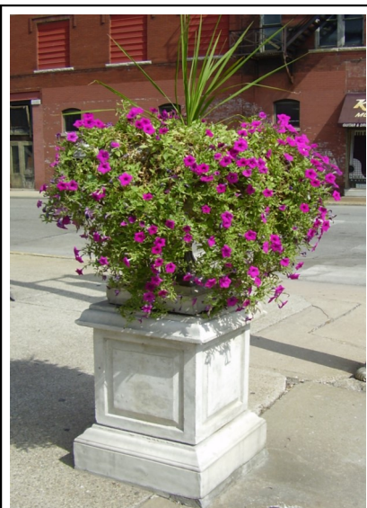
The Pittsburg Beautiful Endowment Fund provides dollars for aesthetic improvements in Pittsburg such as the plantings for the urns found downtown.