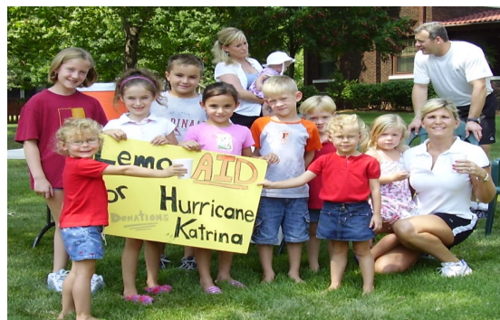
Local children operated a LemonAID stand to raise funds for Hurricane Katrina relief. They collected more than $700.00.