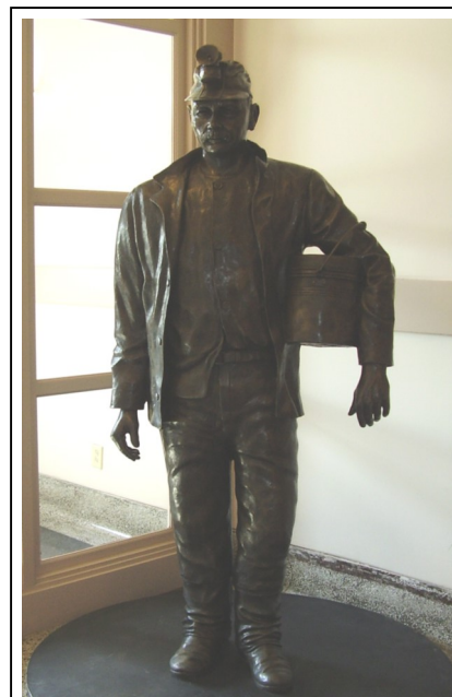
This life-like sculpture of a coal miner, currently on display at the Hotel Stilwell in downtown Pittsburg,, will be placed in Immigrant Park/Miner's Memorial.