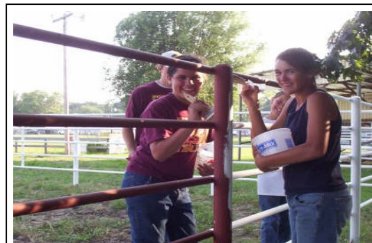
Lucky Riders 4-H, Girard, used CFSEK grant dollars to make needed improvements to the Crawford County Fairground horse arena.